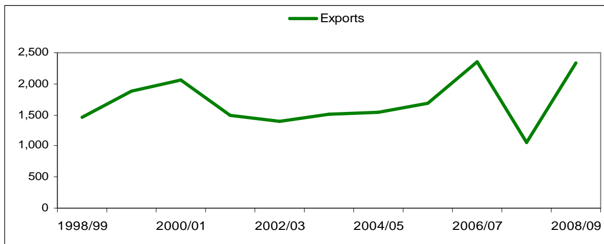
Number of Thoroughbred Horse Exported 1998/99-2008/09

successes of Australian-bred horses all combining to substantially enhance the marketability of Australian bloodstock.